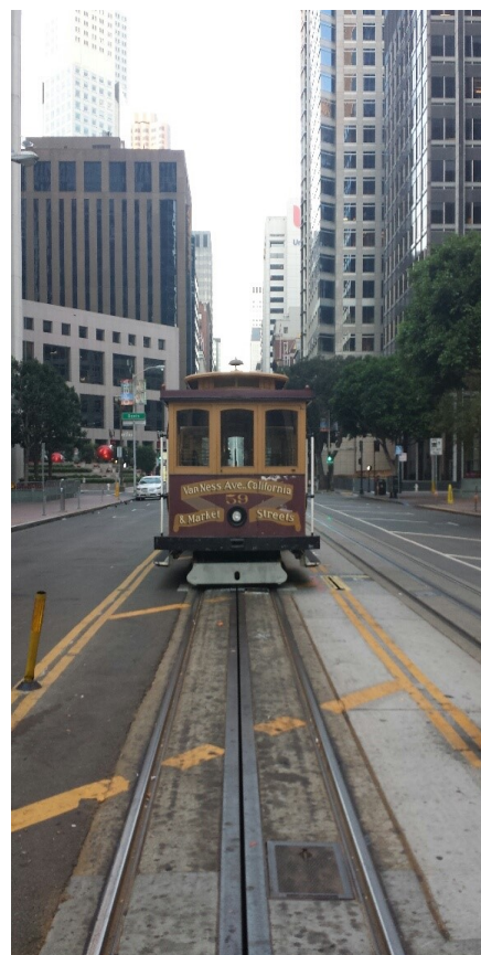
2014 AGM coming at you